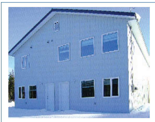
ALS Minerals Whitehorse 78 Mt. Sima Road Whitehorse, YT, Canada, Y1A 0A8.